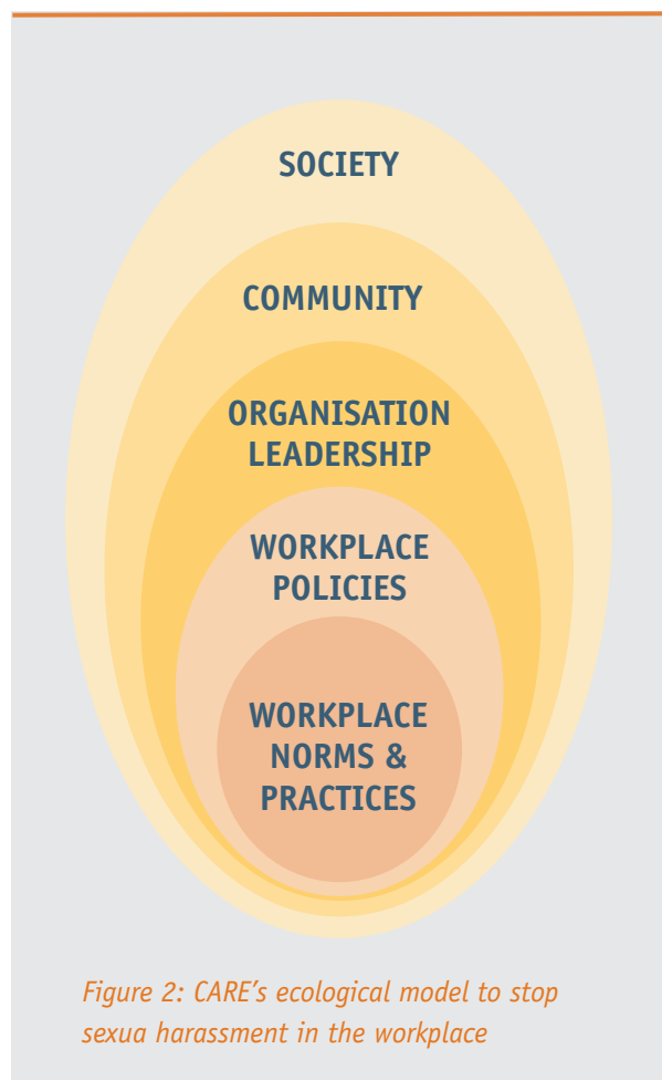
Figure 2: CARE’s ecological model to stop sexual harassment in the workplace